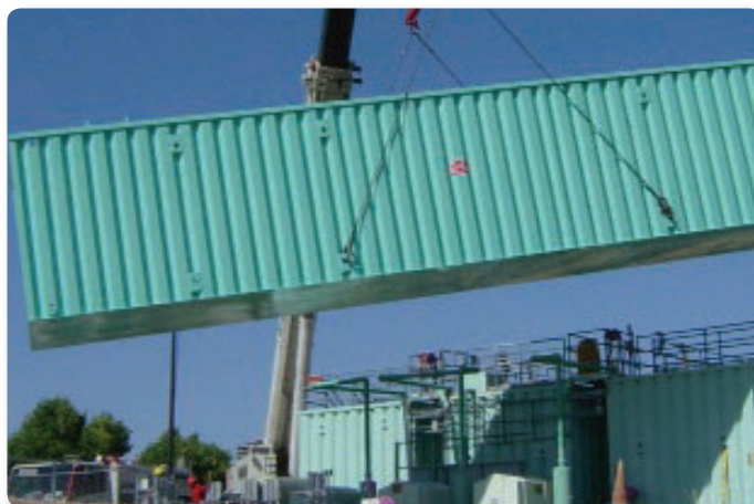
Multi-train factory-built ADDIGEST® installations are available, as seen in this picture.