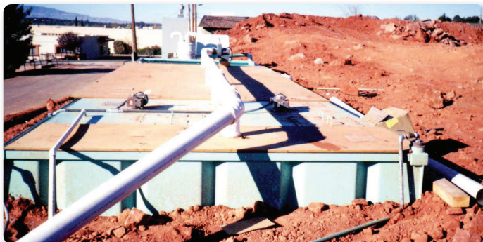
Earth-insulated, this factory-built ADDIGEST® is installed below grade, as shown above.