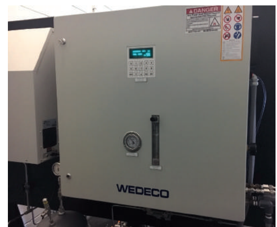
GSO 30 Ozone Generator from Wedeco, a Xylem Brand.