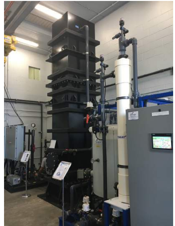
Biofiltration column from Leopold, a Xylem Brand that includes XA Underdrain and IMS 200 Media Retainer.

Altamonte Springs frequently conducts educational tours at the pureALTA facility, hosting groups ranging from middle and high school students to water utility personnel from around the country.