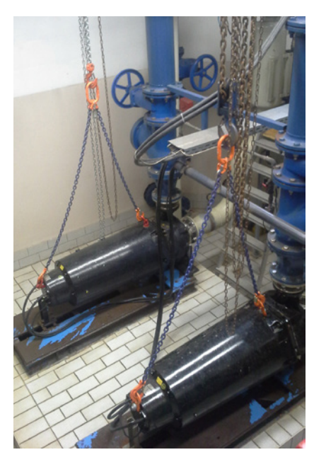
Submersible sewage pumps type ABS XFP installed in the pumping station