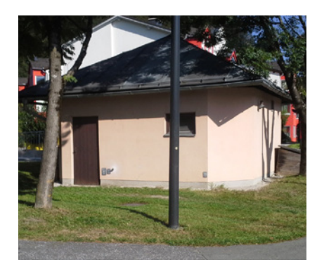
Network pumping station in Zell am See

The horizontal, dry-installed pumps at the network pumping station Zell am See were clogging at least 2-4 times a week, also during weekends. Consequently, the pumps had to be lifted and the blockage removed. A high amount of sanitary items and incontinence adult diapers from the nearby hospital were the root cause for the clogging.