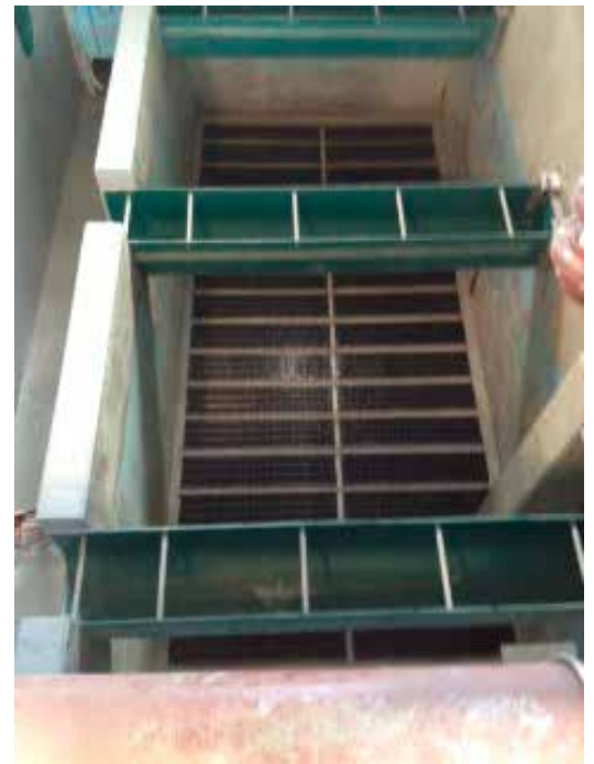
The Type XA™ Underdrain with I.M.S. ® 200 media retainer being installed in the existing filter basins.

Oversole was happy to report that filter runs have tripled. The inefficiency of the previous system resulted in limited filter run times, as the filter media had to be cleaned via backwash every 90 hours. Now the filters can run three times as long before requiring a backwash. The new filters produce higher quality effluent and ultimately higher quality water is delivered to the residents and tourists of Salida. Oversole is very pleased with the results, cost savings, and overall return on his investment in Xylem's cutting-edge Leopold filter system.