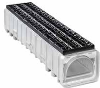
The Leopold Type XA™ underdrain with I.M.S. ® 200 media retainer

Xylem, Inc. 14125 South Bridge Circle Charlotte, NC 28273 Tel 704.409.9700 Fax 704.295.9080 www.xylem.com