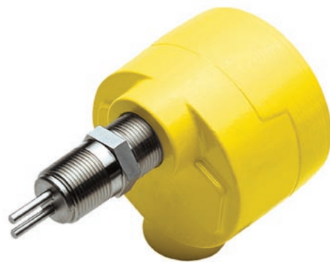
Figure 3. FCI Model FLT93S

The FLT Switch operates over a wide setpoint range in water from 0.01 FPS to 0.5 FPS (0.003 MPS to 0.9 MPS). Level/interface accuracy is \pm 0.25 inch ( \pm 6.4 mm), and measurement repeatability is \pm 0.125 inch ( \pm 3.2 mm). The standard FLT93S withstands operating temperatures from -40^{\circ}\text{F} to 350^{\circ}\text{F} ( -40^{\circ}\text{C} to 177^{\circ}\text{C} ), and an optional configuration is available for temperatures from -100^{\circ}\text{F} to 850^{\circ}\text{F} ( -73^{\circ}\text{C} to 454^{\circ}\text{C} ).