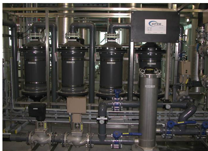
Figure 1: Oxygen removal system at Dutch power station

The goal was to achieve an O 2 specification of < 10ppb for filling the storage water tanks and to maintain a constant fill level. For an inlet water flow of 30 m 3 /h, Jotem installed four 14-inch Liqui-Cel® Contactors connected in series. To achieve the low O 2 requirements, the system operates in N 2 -vacuum (combo) operation. The vacuum pump pulls vacuum through a parallel connected manifold from the bottom gas ports, while the N 2 sweep gas enters the contactors through the top gas ports. The O 2 content is reduced through each membrane step.