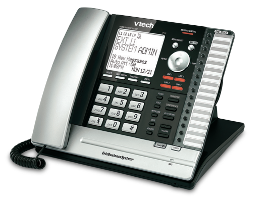
UP416 Main Console

This 4-line, expandable system keeps up with your growing needs but also keeps it simple—no need for complicated wiring or expensive installation technicians. It's a low-maintenance way to manage your calls and keep your business thriving.