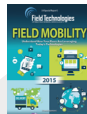
December 2016 Annual Field Mobility Survey