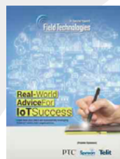
September 2016 Internet Of Things