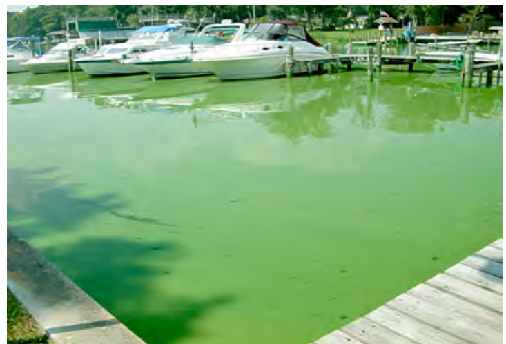
The Air Dock System Breaks Down Blue Green Algae Bloom