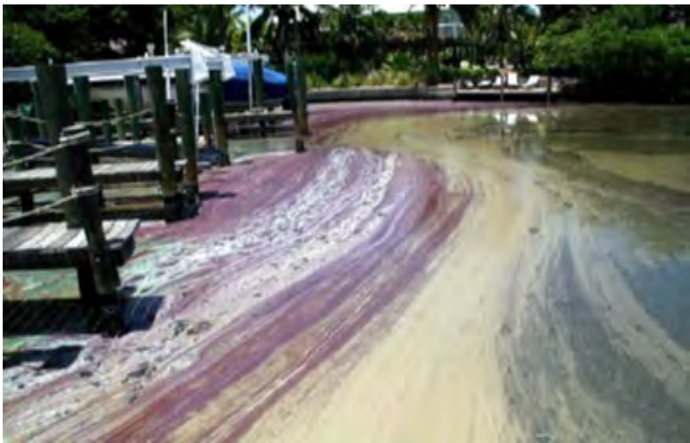
DO2E's Air Dock Systems Mitigate The Need For Costly Preventive & Remedial Measures

These units are environmentally friendly, noninvasive, have no moving parts, are air driven and operate at a noise level of less than 35 dB.