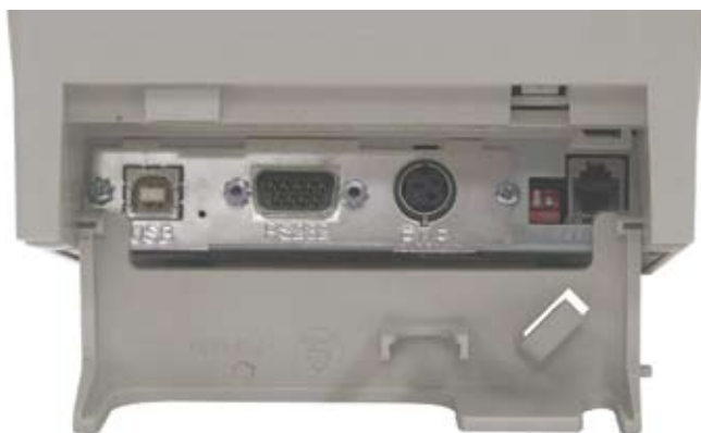
Dual RS232 Serial/USB Interface Shown Above

The A798 represents the next generation of reliable, high performance, low priced receipt printers. Built on CognitiveTPG's reputation for delivering durable printers, the A798 combines exceptional print speed with a small footprint, standard dual interface, and monochrome printing.