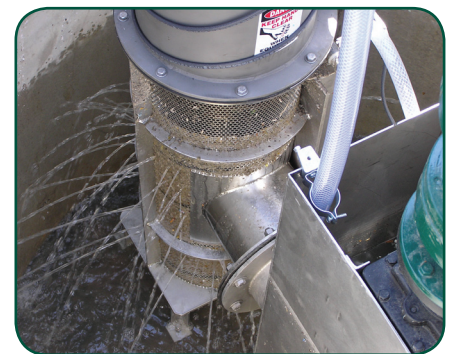
High Flow Screening