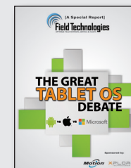
April 2015 Mobility Trends