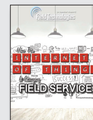
September 2015 IoT/M2M Trends