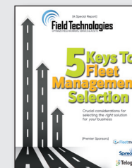
July 2015 Fleet Management