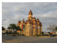
Caldwell County, TEXAS

D-Link Network Solution Provides High Performance Backbone