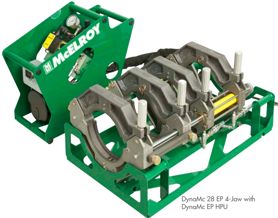
DynaMc 28 EP 4-Jaw with DynaMc EP HPU

Fusion Capability for 2" IPS to 8" DIPS (63mm - 225mm)