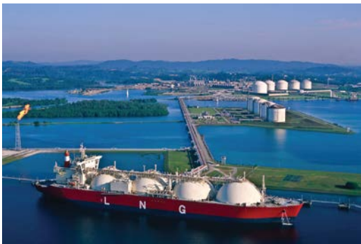
Figure 1: Liquid Natural Gas tanker at port

Over long distances, the safest and most economic method of transporting natural gas is in a liquid state. Plants dedicated to turning raw natural gas into Liquefied Natural Gas (LNG) and later back into gas for distribution are either on-stream, under construction or planned all over the globe. The production, processing, storage, transportation and distribution of Natural Gas all require accurate, repeatable flow measurement.