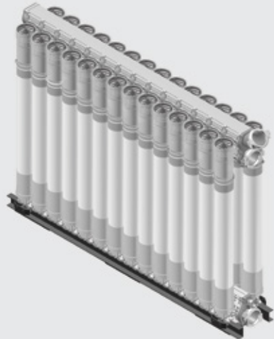
MEMCOR® CP II SYSTEM ASSEMBLY RACK