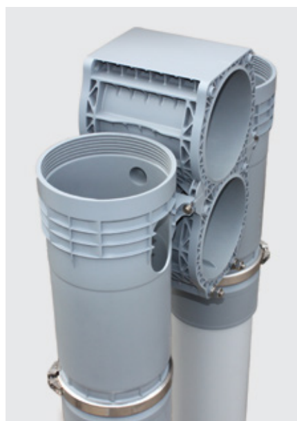
THE L40 MODULE HOUSING, WASTE HEADER AND FILTRATE HEADER

Self-supporting MemRACK arrays reduce membrane array footprint by up to 50% compared to previous MEMCOR system offerings. MemRACK arrays also fit in standard shipping containers allowing MEMCOR CP II systems to be quickly delivered and deployed anywhere in the world.