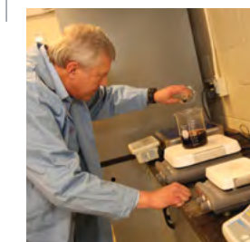
PILOTING AND APPLIED TESTING