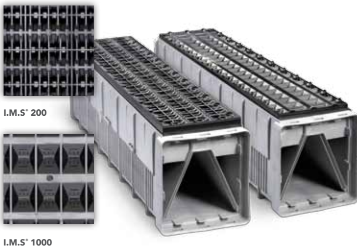
I.M.S. ® 1000

* Indicates feature of both I.M.S. ® 200 and I.M.S. ® 1000