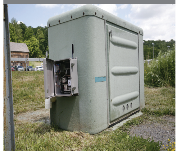
RS-3314 Monitoring Lift Station

Information is stored for archival use in the Enterprise SQL database to share with other applications (e.g. SCADA, modeling, billing) and made available to users in report format or graphical presentations on a web site.