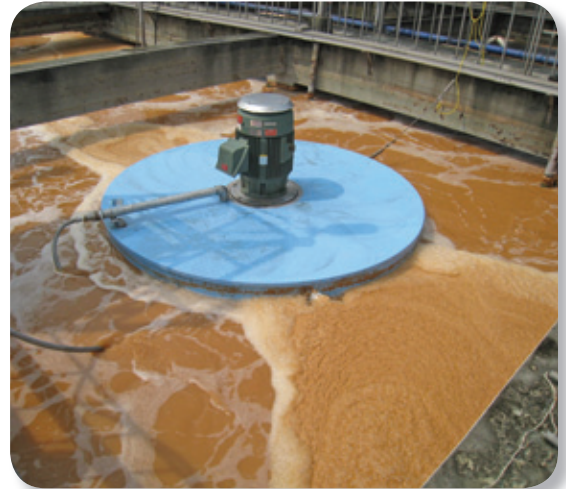
OxyMix® Pure Oxygen Mixer in operation.