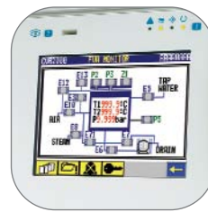
Graphic synoptic display