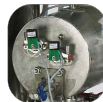
Separate steam generator