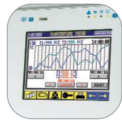
Graphic cycle display