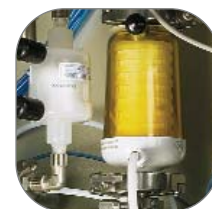
Decontamination of exhaust air with sterile filter