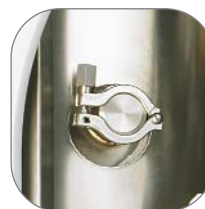
Connection for testing and validation