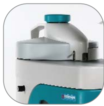
Lid detail with protective thermal cover