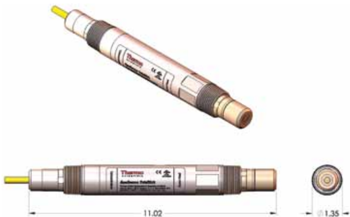
ppb Trace DO DataStick Dimensions