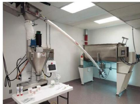
Ribbon Blender with dust-tight flush mount ball valve connected to a discharge screw conveyor.